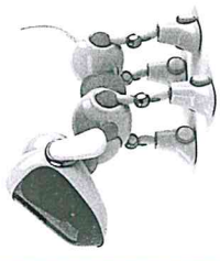
► SB p. 68